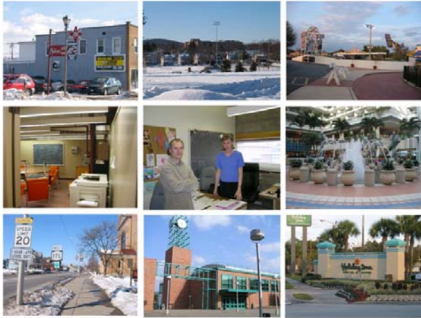
Figure 2: Some sample images used in our tests.